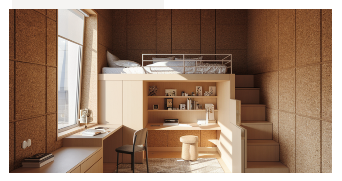
Think of a unique cork panel adding warmth and texture to your home office. Could this be the signature touch of your Portuguese decor?

For a subtle, eco-friendly design statement, consider cork accessories like coasters, trays, or even furniture.