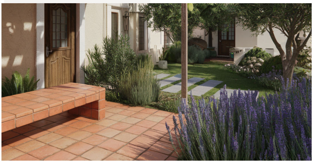
Imagine a warm, earthy terracotta entryway greeting you every day—could this be the start of your Portuguese-inspired home?

To enhance terracotta's warmth, add textures like woven rugs or natural fibers in the same earthy palette.