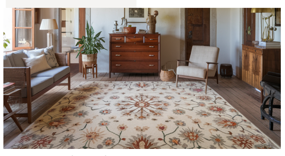
Picture a beautifully crafted Arraiolos rug. Could this connect your home to Portugal's rich artisanal traditions?

Layer textiles in different textures and patterns to add character and comfort to your space.