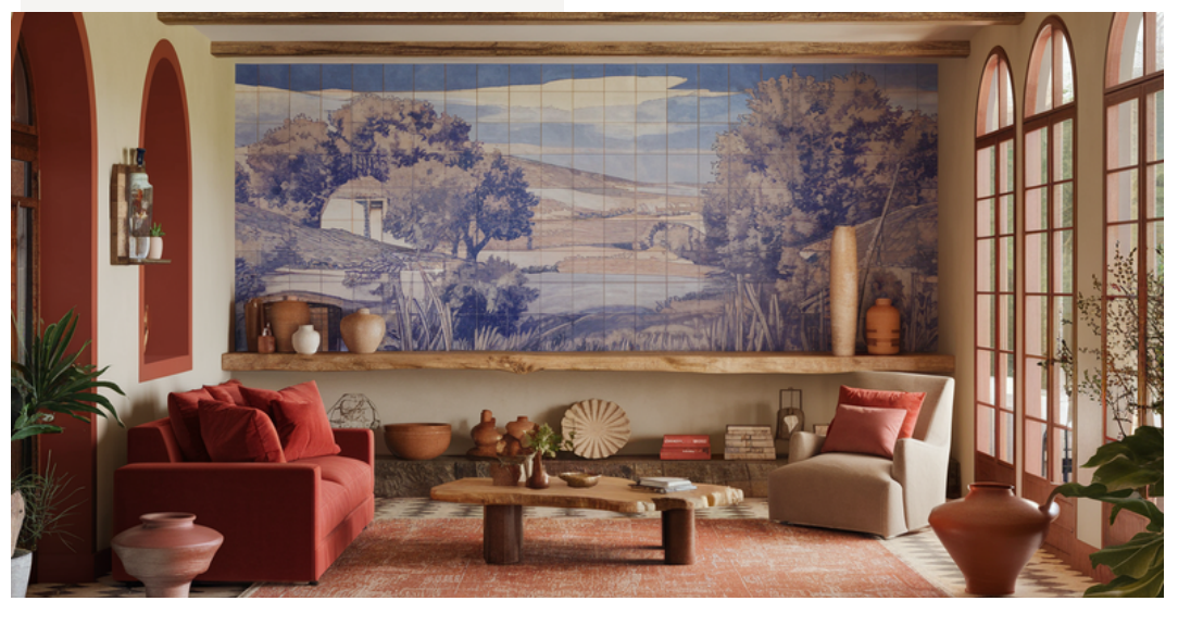
Picture a vibrant azulejo panel bringing Portuguese artistry into your home. Could this be the piece that transforms your space?

Mix classic blue-and-white tiles with contemporary pieces for a modern twist on a traditional Portuguese look.